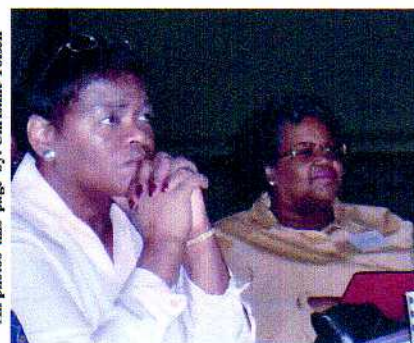
Retreat/Workshop participants show various expressions of attentiveness.