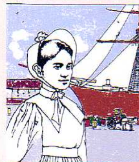
Sketch taken from the Mother Lange Coloring Book

As with immigrants the world over, the family of Elizabeth Clarisse Lange fled the revolution of Haiti. They sought a better life taking refuge in Santiago de Cuba. Elizabeth, due to dire circumstances there, migrated to America and eventually settled in Maryland—a slave state, no less. However,